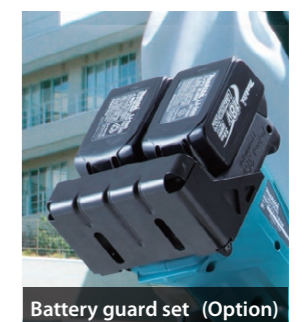
Battery guard set (Option)

Users, who have 2 units of 18V battery (BL1830), can make use of HRU01ZX2 with BVC02.