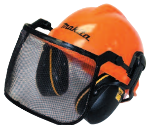
Helmet CU 20C