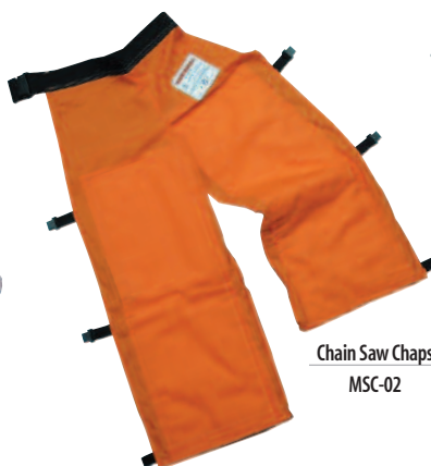
Chain Saw Chaps MSC-02