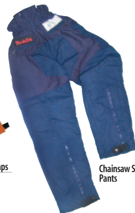
Chainsaw Safety Pants